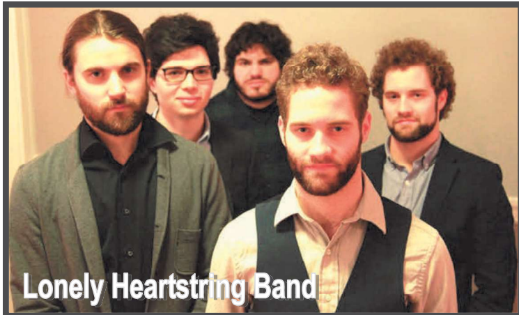
Lonely Heartstring Band