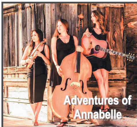
Adventures of Annabelle